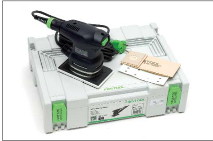
Small orbital sander