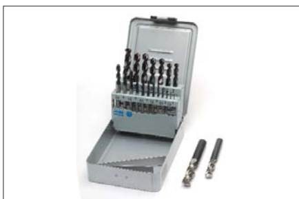
Drill bit set