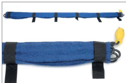
Cable heating blanket