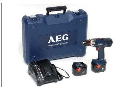
Rechargeable power drill