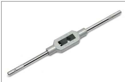
Adjustable tap wrench