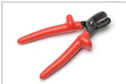
Small cable cutter