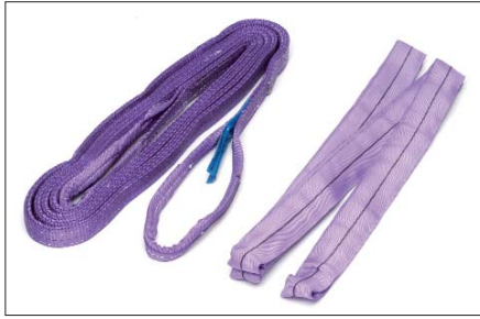
Lifting strap / Round sling