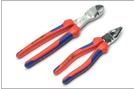
Side-cutting plier / Combination plier