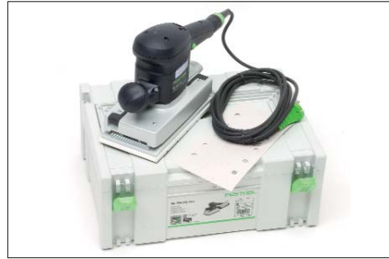
Large orbital sander