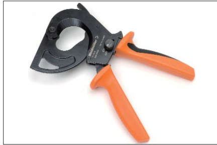
Large cable cutter