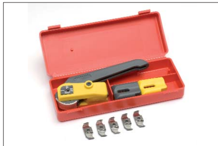
Cable sheath cutter