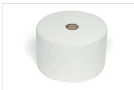
Paper cleaning tissue