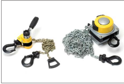
Chain hoist / Chain block