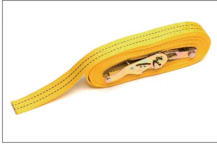
Ratchet lashing strap