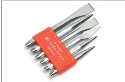
Chisel and punch set