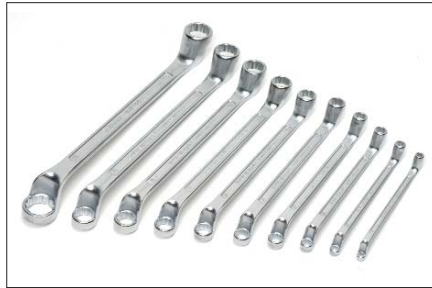
Double-end ring spanner set