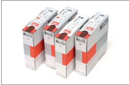
Abrasive textile tape