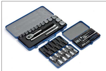
Allen wrench socket / Socket set